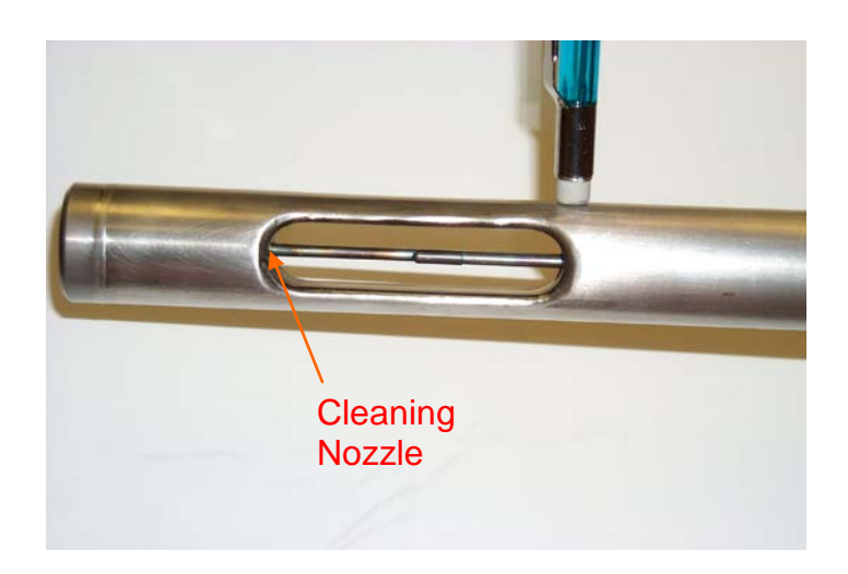
Figure AE-2. Typical purge sensor and window.

The solenoid control valve for purge air is powered from the MFT B-Series electronics using the DO2 terminal block (TB6, pin 1 switched +24 VDC, pin 2 ground). This output is rated for continuous 24 VDC, 0.5 A, (can use a 1 A valve for a few seconds). See field wiring diagram 342038, sheet 3 and 759038 for recommended solenoid wiring.